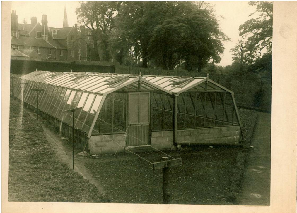
Above: Glasshouses with Hall in the background – looking north Below: Beds, paths and glasshouse – looking south-east Both images undated but believed to be 1950's