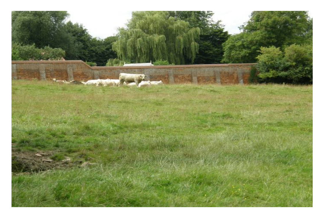
This is taken from the outside of the East wall and shows the buttresses. It also shows the extent of the renovation of the wall.

This photo shows the renovated East and South walls and the planting at the time of our visit