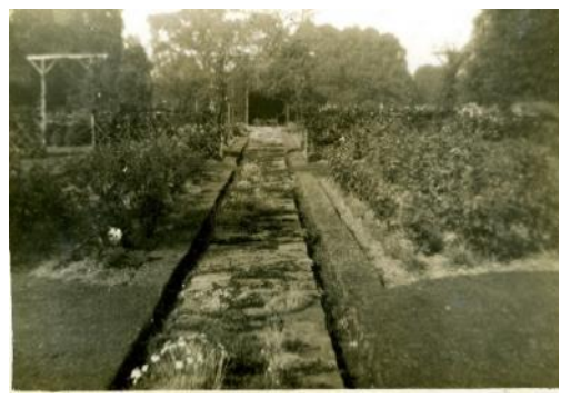
Formal gardens at Fulwell Park

Although named Fulwell Lodge when built in 1623, Sir Charles Freake renamed it Fulwell Park when he acquired the estate in 1871. Count Reginald Henshaw Ward, an English-born, American millionaire banker known as 'The Copper King', lived here from 1903.