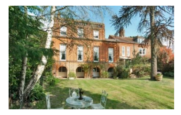
Garden Front of Oakhurst