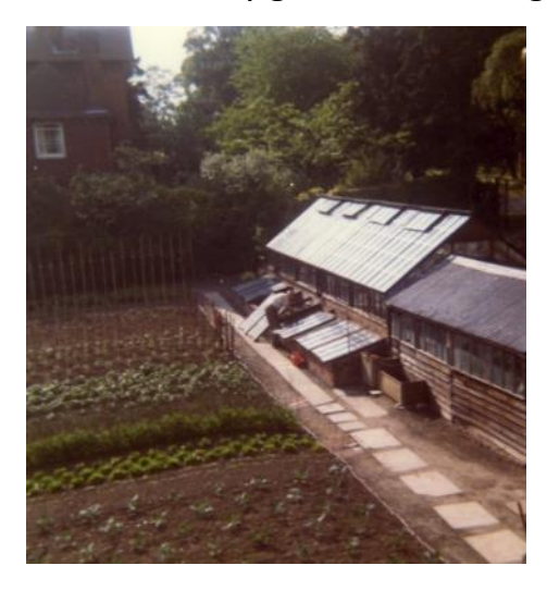
Mount Park Estate potting shed, hot & temperate greenhouses

Dad was soon appointed Head Gardener. Usually up to four gardeners were employed on the estate and they grew a wide range of fruit, vegetables and flowers providing year-round fresh