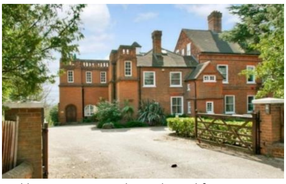
Oakhurst, Mount Park Road, road frontage

Early in the nineteenth century the southern slopes of Harrow-on the Hill comprised 'Mount Farm', 'Prings Farm' and 'The Park' (the latter now forms a substantial part of Mount Park Estate Conservation Area). Plots of land were sold in stages at auction during the latter half of the 19th century. The sale particulars of the 22nd May 1885 promoted the land as, 'offering choice sites for the erection of a superior class of residence... occupying one of the finest positions in the county of Middlesex and commanding exquisite panoramic views extending into eight counties, and charmingly studded with finely grown Chestnuts, Oak, Elm and Pine'.