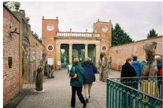
The Apsidal Gallery

As we returned to the house for a welcome visit to the Savile Restaurant and a delicious cream tea, I noticed a delightful corner of the garden where an enterprising wisteria had left the wall and was roaming off over various bushes, obviously on a take-over bid. In this area there was a very unusual horse chestnut with red leaves and deep red flowers which I believe is an Indian horse chestnut, Aesculus indica , and there was also a mulberry vine with divided leaves which is probably a form of the black mulberry, Morus nigra .