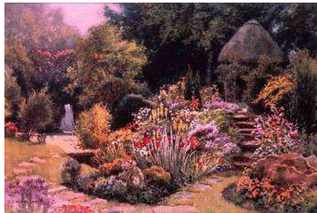
The Japanese Garden

In 1910 an article in The Gardener's Magazine remarks on both the extent and the beauty of the finely wooded and picturesque park. It describes the Kitchen Garden and several themed areas. The article listed the huge numbers of each species of roses, carnations, trees, shrubs, flowers, and fruit including bunches of Madresfield Court grapes weighing on average 6 lbs a bunch. Described were a Japanese garden on the site of an old orchard with paved walks, a small pond, stone lanterns, a waterfall and a thatched tea house (Japanese gardens had become fashionable from the 1890s e.g. at Clivedon and Newstead Abbey); a Roman garden surrounded by fruit trees (this was bulldozed down in 1981); and a Rose Garden bounded by a yew hedge which included roses such as Madame Caroline Testout, Liberty, Killarney, and Prince de Bulgarie. This also had a