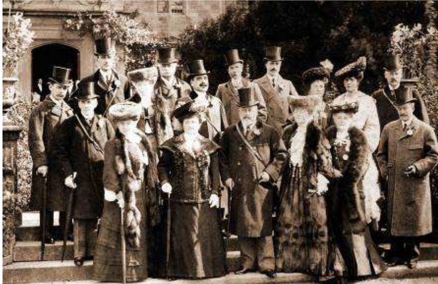
A Royal Weekend Visit in 1904.

was during this period that the vast kitchen gardens consisting of some 1.6 hectares including a vast walled area, four ranges of greenhouses, mushroom houses, vineries, several heated cucumber pits, a lean-to propagating house, bothy, fruit store house, potting shed and kiln house came into their own