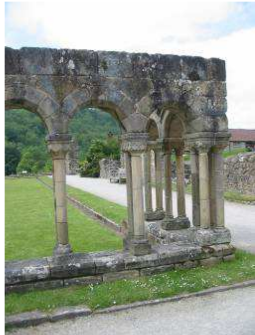
Remains of a corner of the cloister at Rievaulx Abbey

The gardens have left very little clear evidence of what was created by the monks, but it is known, from other sources such as Rievaulx and Abbeys in France, that although they grew food and planted trees and fruit trees, ornamental planting was not part of their agenda. There would be a herb garden, as all Abbeys had Infirmarys and cared for the sick. A vegetable garden was often found near the cemetery. There would be stew ponds for the fish they ate. The Abbot had a garden for himself, for his own enjoyment, but there is no physical evidence to help us find this. The cloister was an important part of the daily activities and included several trees, usually with a central tree which provided a focus point. There was an orchard and a little orchard.