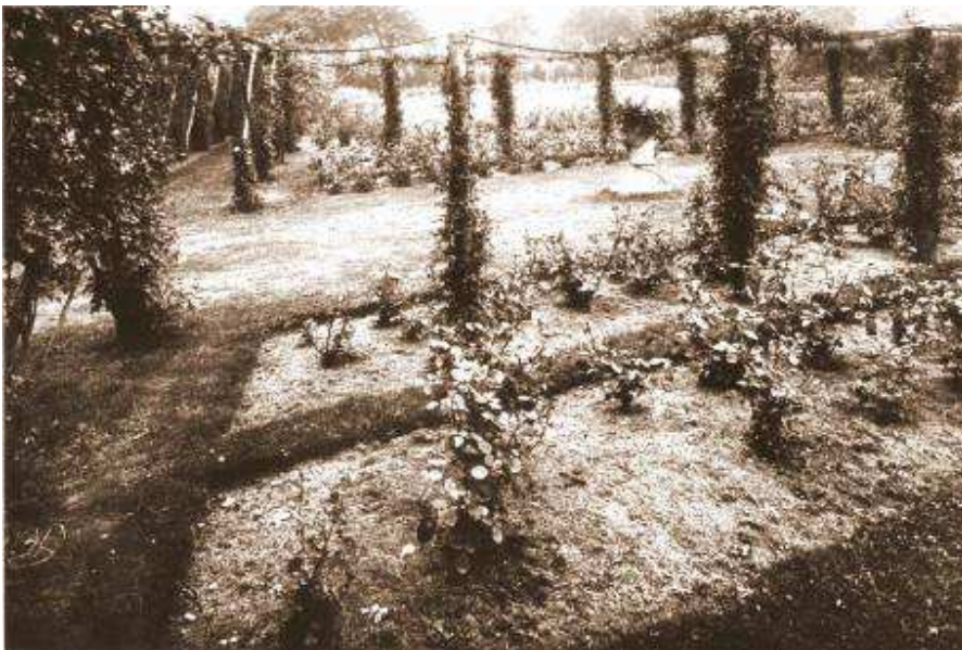
The Rose Garden

Today the Kitchen Garden, Rose Garden and Japanese Garden to the south no longer exist – the land is no longer in the ownership of the council and has been given over to a modern housing estate. Still surviving but now part of the housing estate are the Water Tower, Brew House and Gardener's Cottage. Rufford Abbey Country Park's new formal gardens are within yew hedges and include a herb and a rose garden which have been re-established since the 1970s. These are located to the south east of the bath house/Orangery. Further new features are planned.