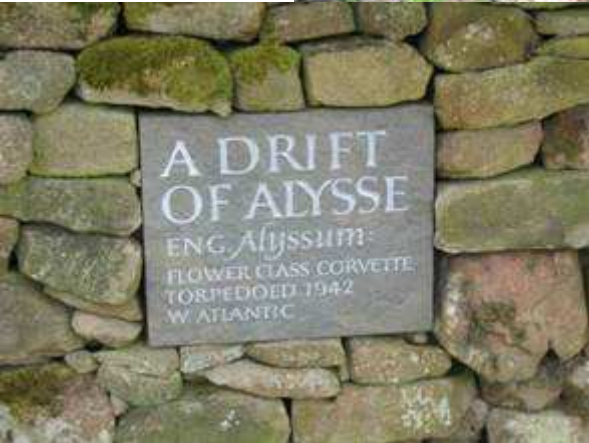
Little Sparta The Garden of Ian Hamilton Finlay