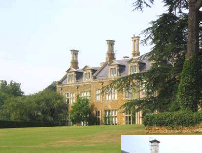
Holdenby House July 2006