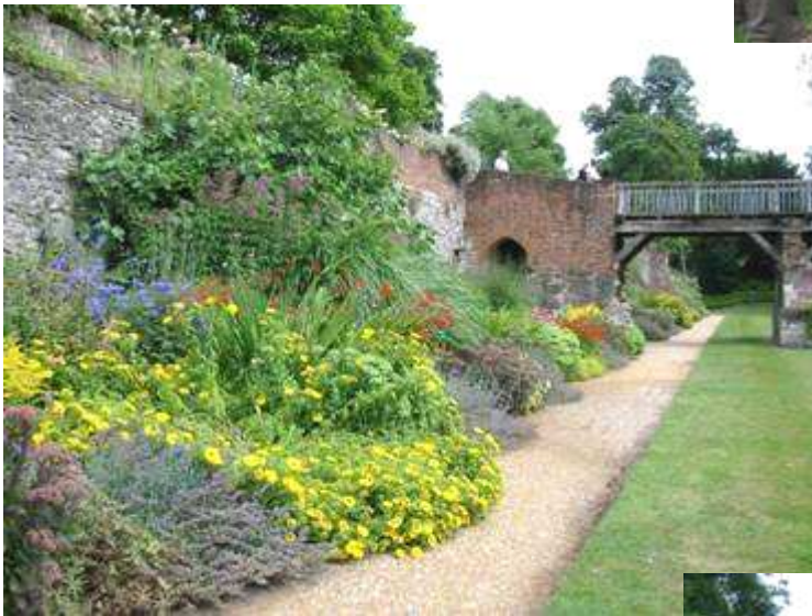
Eltham Palace June 2006