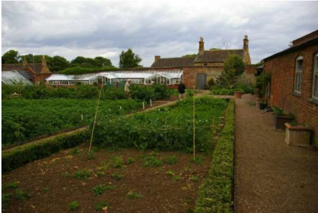
This view is taken from the backsheds and shows the glasshouses on the Eastern wall of Nevill Holt WKG beside the main door into the garden from the street