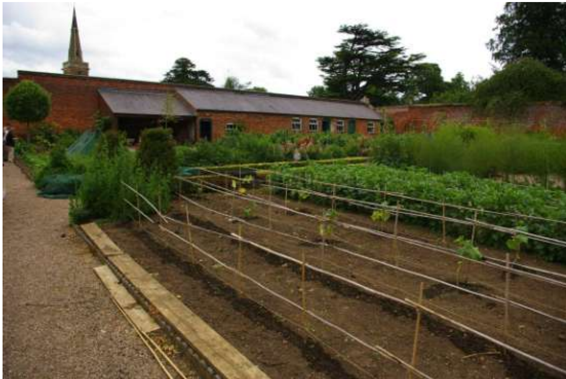
This view of the WKG at Nevill Holt shows the backsheds and the open fronted roofed storage area along the Southern wall