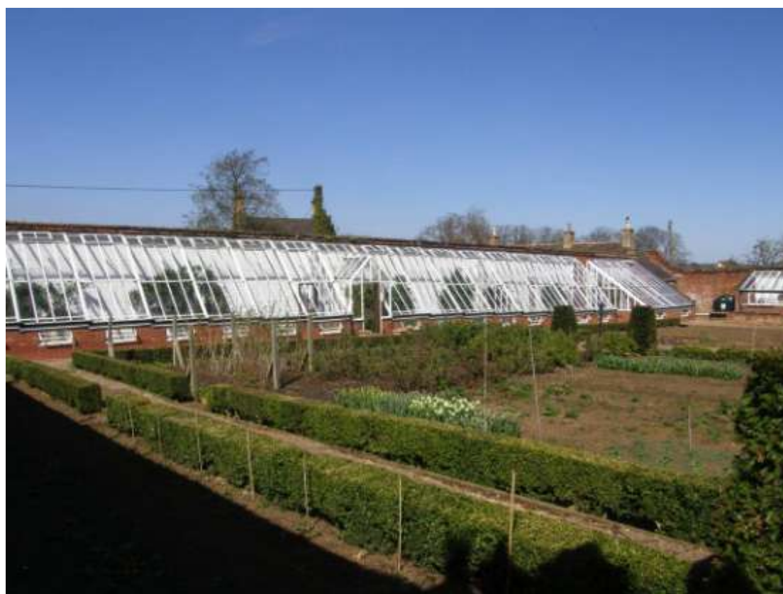
View of the glasshouses on the North wall of the WKG at Nevill Holt. The vinery is the separate glasshouse at the Eastern end. Beyond this is a small lean to brick building that may have housed the pump. The current planting is shown on all three photos.